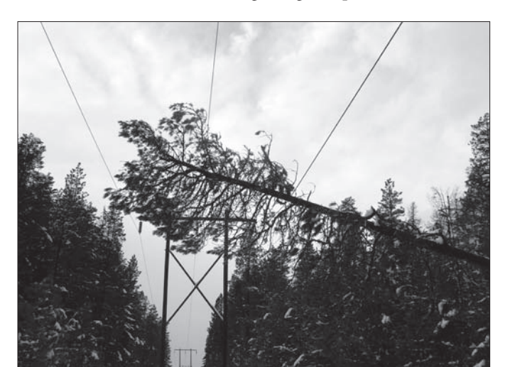
Lineworkers for Klickitat PUD untangled trees from the utility's Glenwood transmission lines after snow and ice in January 2012 brought down limbs and trees.

Step 1: Transmission towers and lines supply power to one or more transmission substations. Without these lines being energized, power cannot be